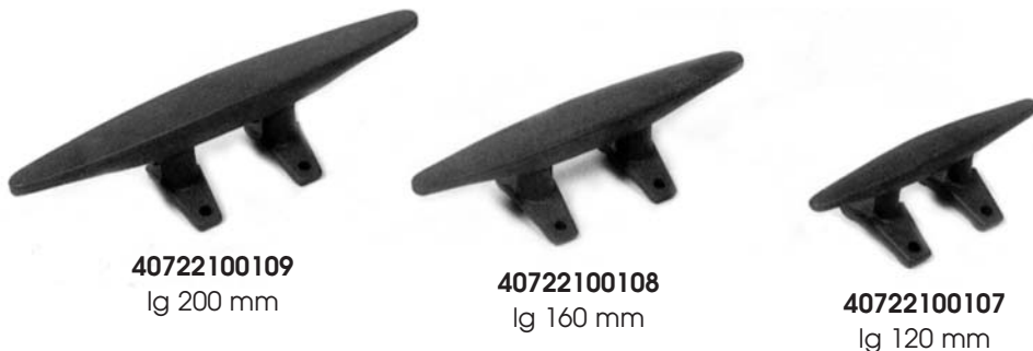
40722100109 lg 200 mm