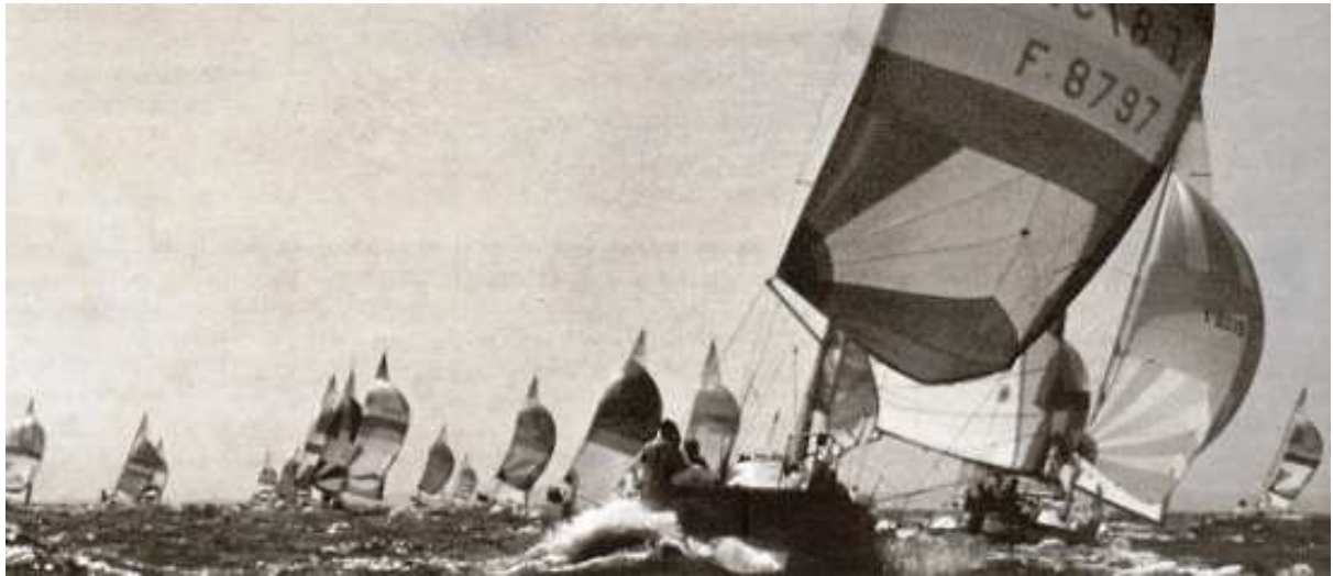
Free Lance shows her downwind prowess against the 40 boat fleet during the 1983 Half Ton Cup