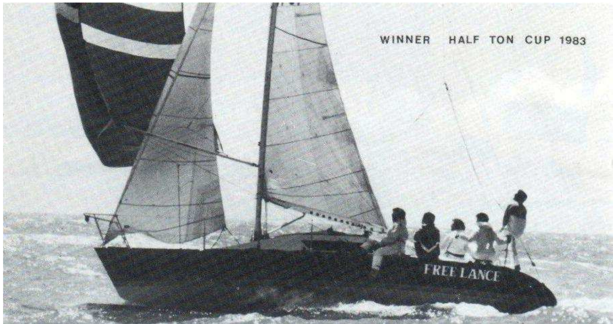
Free Lance is still sailing today and appeared in the results of the 2005 edition of the Half Ton Classics Cup, finishing 20th.