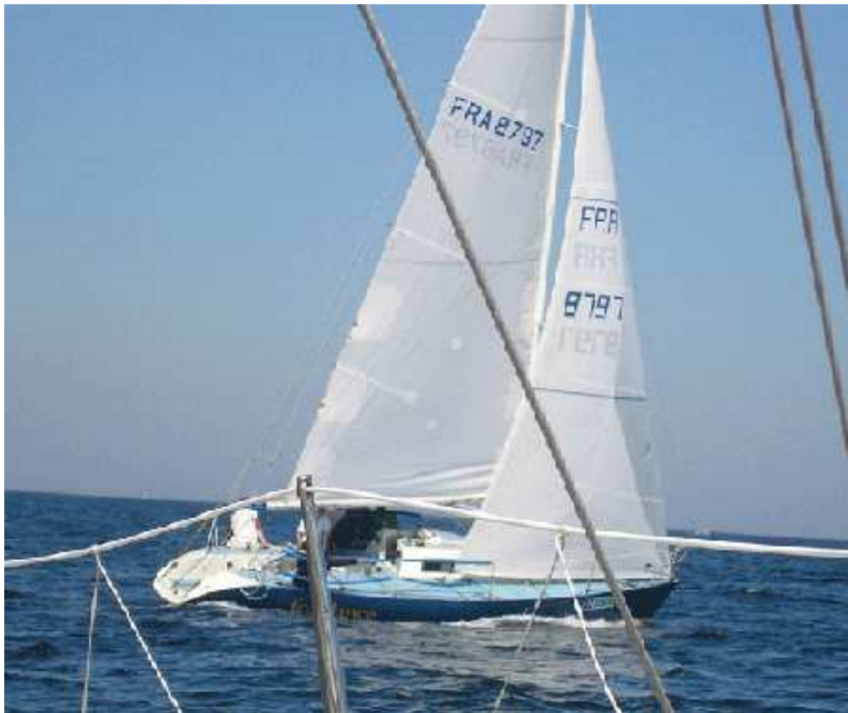
Free Lance in more recent times