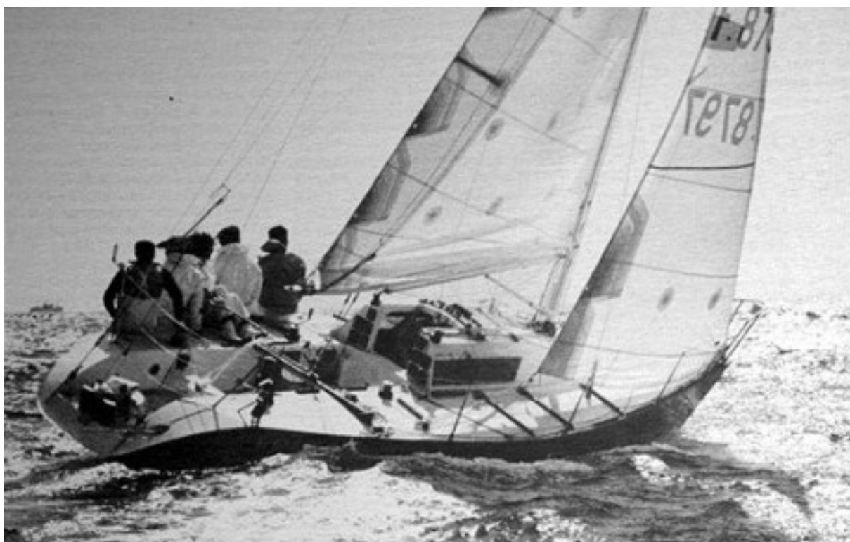
Free Lance makes her way upwind during the 1983 Half Ton Cup

The last inshore race was a hard fight between Free Lance and Fram VIII, with an exciting tacking duel on the last leg, which Fram VIII, with her slightly superior upwind speed, was able to take out. The final long offshore race was another French-dominated affair, and although Cifraline 2 won, Free Lance's second place was more than sufficient to win the Cup. Cifraline 2 finished second, with Scillonia third and Fram VIII fourth. The defending champion, Atalanti II, finished outside the top ten.