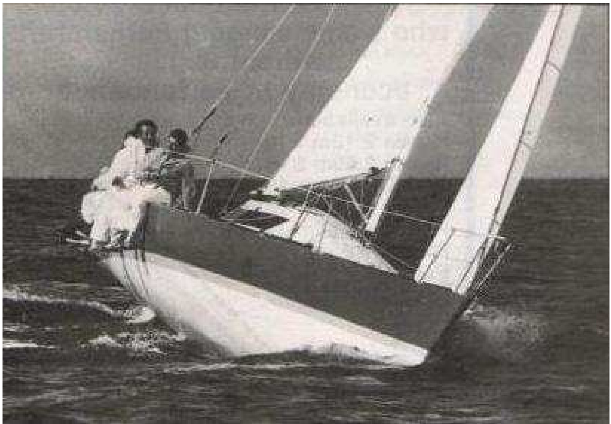
Free Lance approaches a finish during the 1983 Half Ton Cup