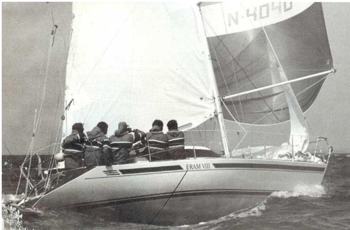
Fram VIII - a strong upwind performer and designed by Norwegian Eivind Amble