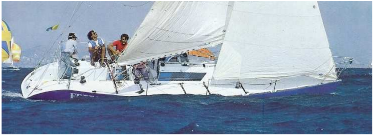
Free Lance seen here during the 1982 Half Ton Cup