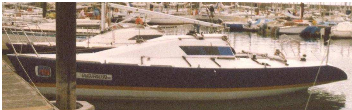
The distinctively elegant sheerline and low freeboard of the 1983 Half Ton Cup winner Free Lance (above) and easy underwater lines (below)

Free Lance was generally considered to be a small Half Tonner, but this was probably an impression given by her low freeboard and modest sail plan, the latter being necessary to offset her fair lines, which resulted in a high rated length, and her moderate displacement. Briand commented that "There are two ways to design a boat. One is to bump the measurement points to gain as much sail area as possible and the other, which I used for Free Lance, is to define how big a sail area is needed and then draw a clean and fast boat".